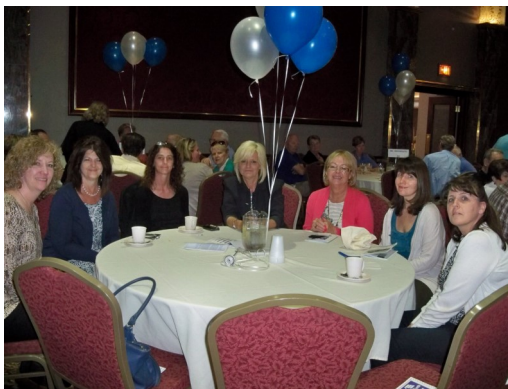
Volunteers from S-Bank in Weymouth

South Shore Elder Services extends its sincere thanks to you all. Our mission could not be accomplished without your incredible dedication and hard work.