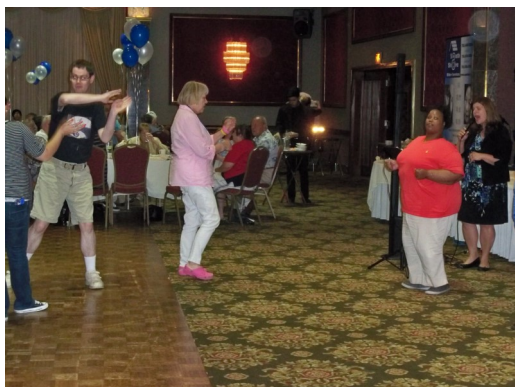
Volunteers dance up a storm.